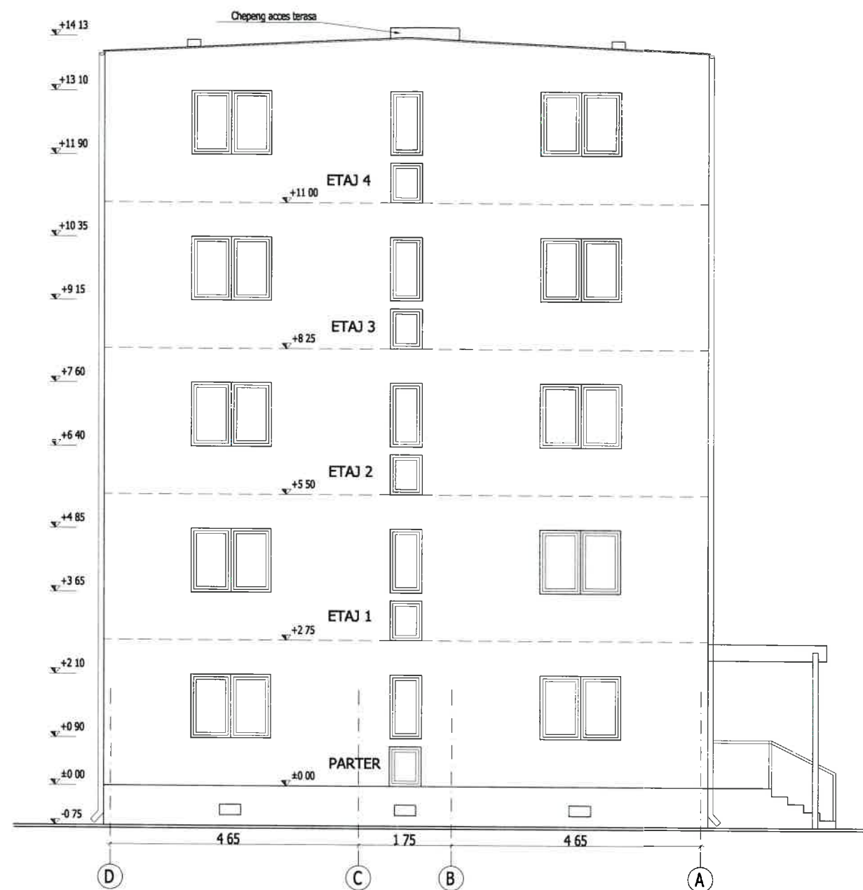
FATADA LATERALA STANGA